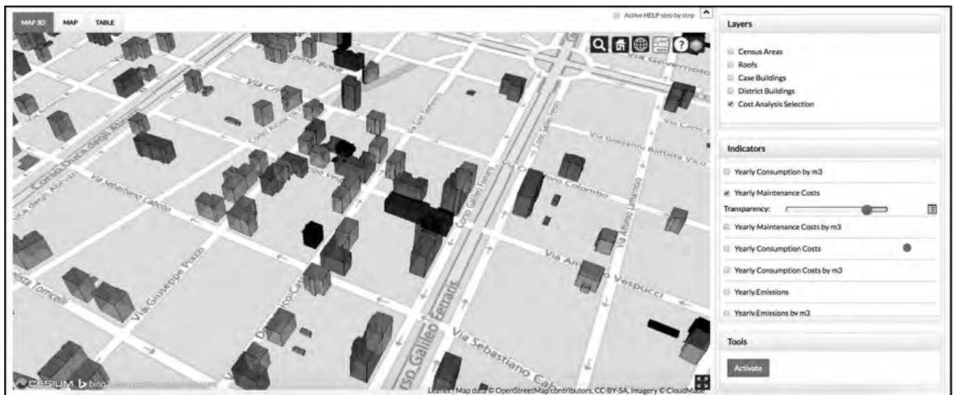
Figure 4 - Visualisation of the maintenance costs for some of the considered buildings

When considering Table 3 it emerges that the criterion deemed most important for the transformation of the “Crocetta” district is the “Investment Costs” (30%) followed by the “PBP” (27%) and the “Reduction of energy demand” (23%). The difference of importance in percentage terms between these criteria is minimal and mainly reflects a strategy of short-term private profit. The